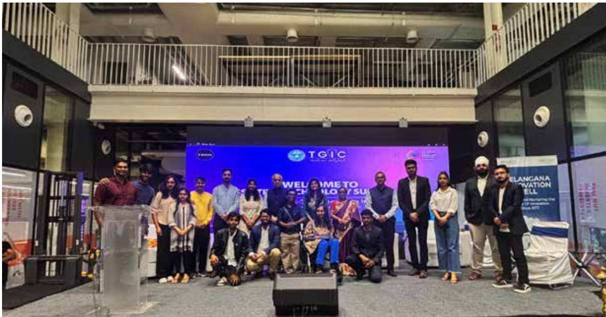
Assistive Technology Summit 5.0: Breaking Barriers, Building Bridges for a more inclusive startup ecosystem empowering the lives of differently-abled.