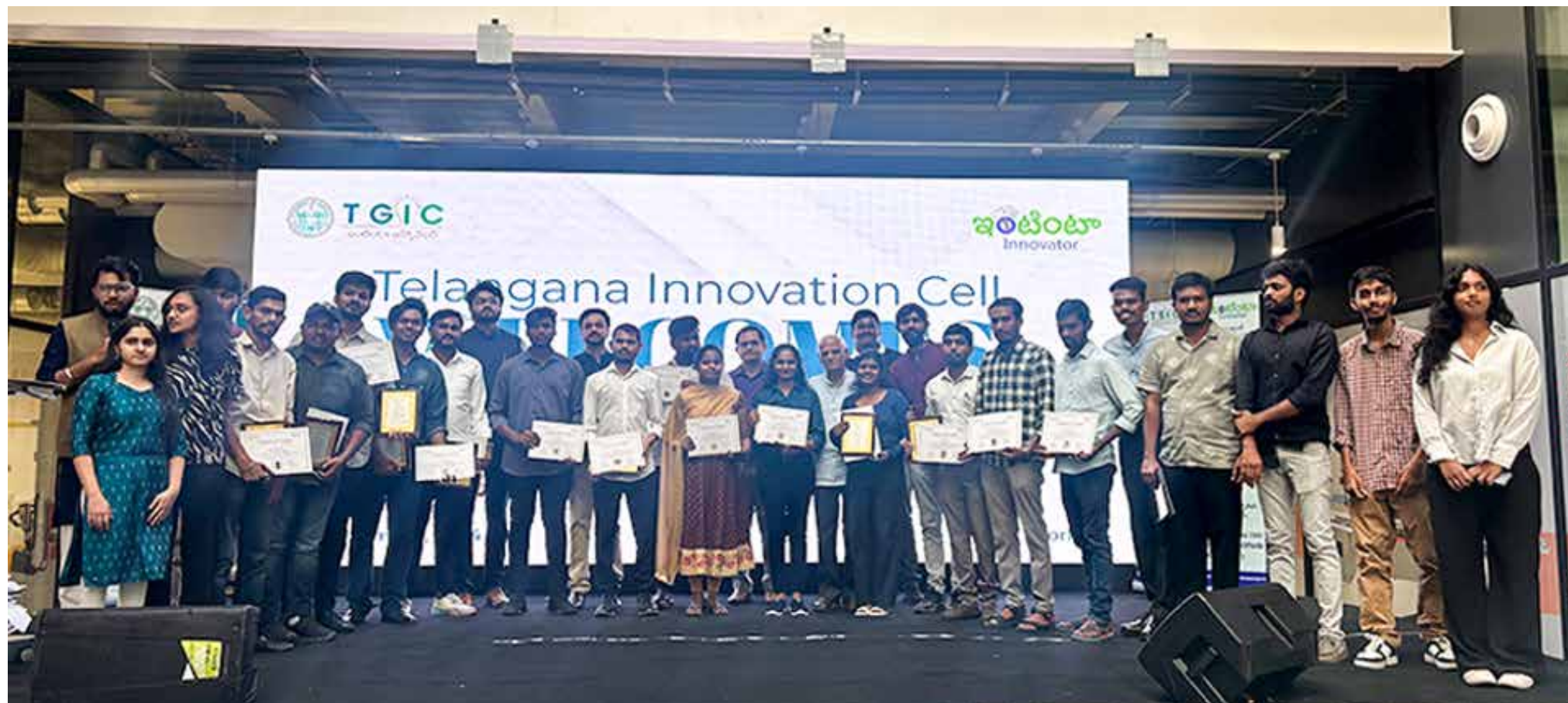
Felicitation Ceremony of 33 Innovation Mitras – the cohort of 2024