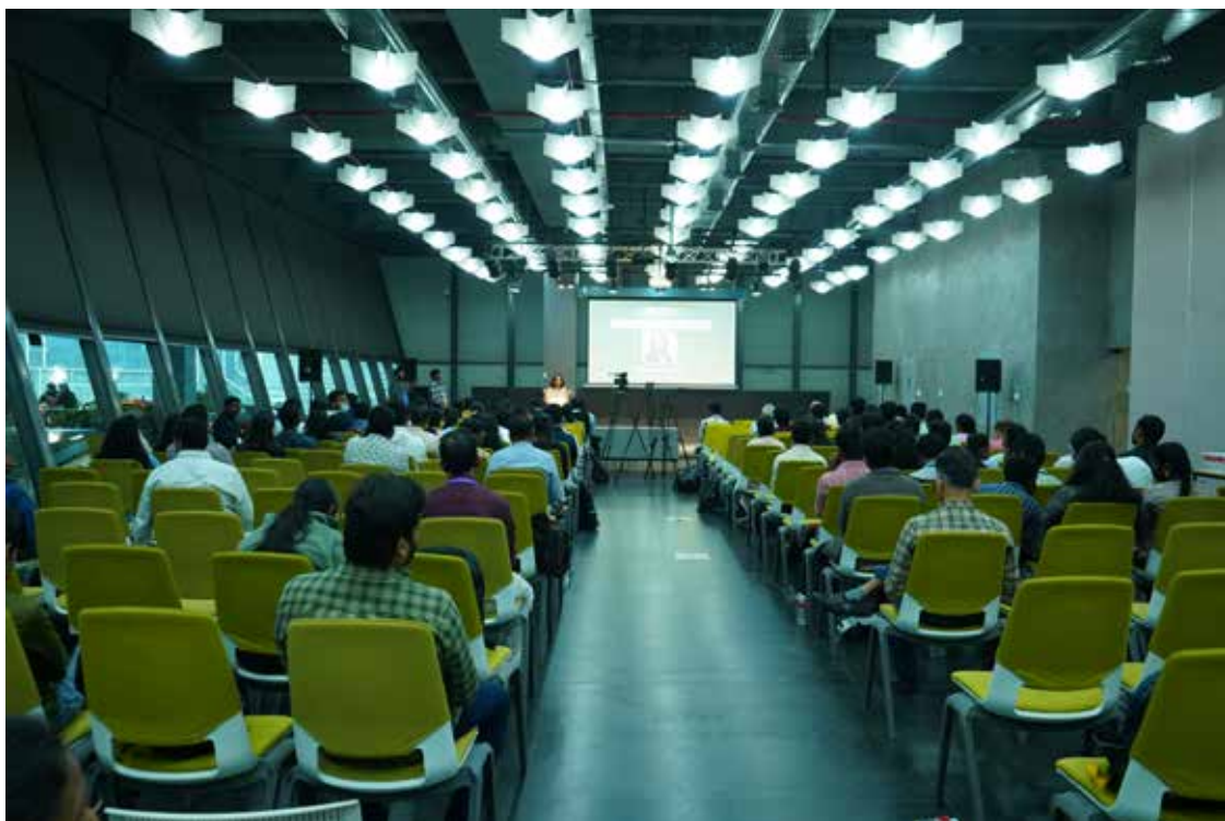
Assistive Technology Summit 4.0