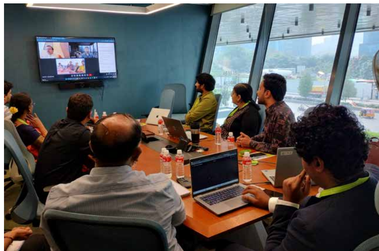
We facilitated the Mission 10X (SIGs) Powered by T-Incubators & Enablers Consortium 6-month scaleup program for early-stage research-connected startups.